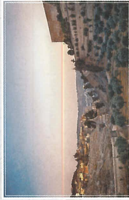
The Mount of Olives