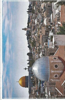
The City of Jerusalem