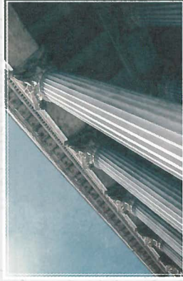
Pilate's Judgment Hall